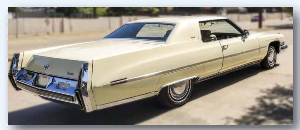
Mark's 1973 Coupe deVille is in excellent condition. The color is Prominade Gold Metallic. One feature Mark enjoys is that the optional padded roof was not applied. This padded creates a home for corrosion and rust.