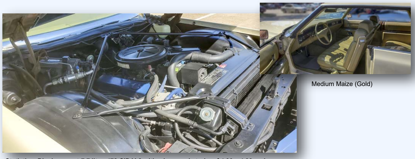
Statistics: Displacement:7.7 liter 472 CID V-8 with a bore and stroke of 4.30 x 4.06 and a compression ratio of 8.5 to 1, producing gross horsepower of 345 @ 4400 rpm and SAE net horsepower: 220 @ 4000 rpm. This engine usually had a Rochester Quadrajet 4MV carburetor. 0-60 mph in 10.1 sec, 0-100 km/h in 10.7 sec and quarter mile time is 17.5 secs.