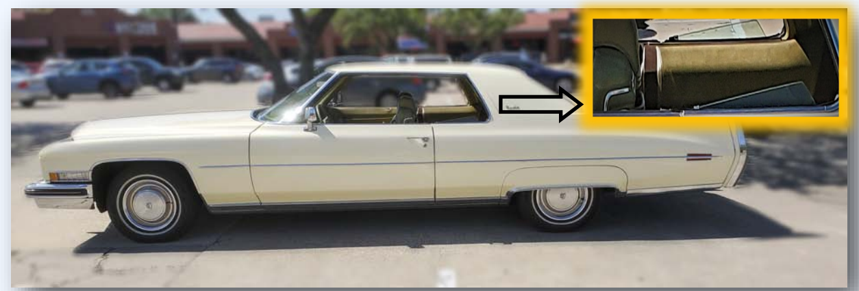
As big as this beast is at 130" wheelbase, the rear glass cannot be lowered to a flush position in the rear seat area.